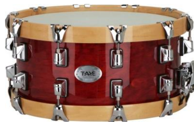
Snare Drum with a Wood Hoop

Wood hoops have less of a sharp attack, you are going to have a round kind of warm body to it. It will give you an open tone, not boomy and less metallic. Metallic hoops are louder, have more attack and can project a sharp sound. Also wooden hoops are more expensive.