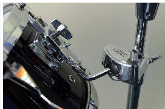
Tama Drum with Mount Drilled on the Shell

On lower-end and semi-pro kits, the mounts may be drilled onto the shell, whereas mid-range and high-end drums will have floating mounts (like the ones on DW kits). It lets the drum vibrate freely. The ideal drum has the least amount of hardware on