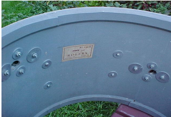
Reinforcement hoops on the top and bottom edges of the drum