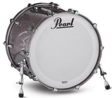
Bass Drum With Spurs

What we have just talked about is one of the reasons why Casey Drums have small lugs, with a single bolt, so this way they have very small contact with the shell.