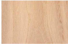
A piece of Beech Wood

With beech wood the sound qualities are a happy medium between maple and birch. They project like maple but are deep and controllable like birch. They are very good for studio recording and live performance.