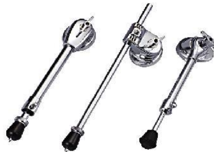
Various types of Spurs