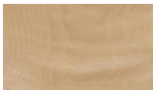
A piece of Birch Wood (bland color just like maple)

Birch is fabulous for recording because of its warmer tone, it is easier to equalize and tune. These drums are like self EQing drums. Birch wood is a very good drum for live performance.