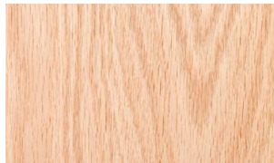
A piece of Oak Wood (aggressive V grain patterns)

Oak is louder than maple, it is boomier, loud and with more sustain, so it is harder to control in a studio setting.