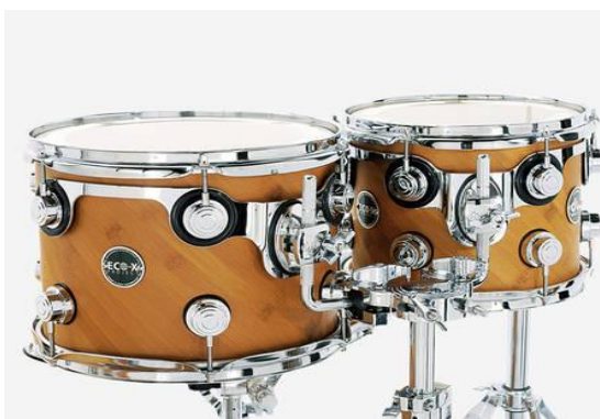
DW Floating Mounts System