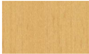
A piece of Maple Wood (bland color and not a lot of grain figure)

Maple is more of a projection wood. It is going to project your drums louder and you will be getting a lot of volume out of a maple kit, so it is a very good choice for live drumming. Maple has nice controllable qualities for studio recording.