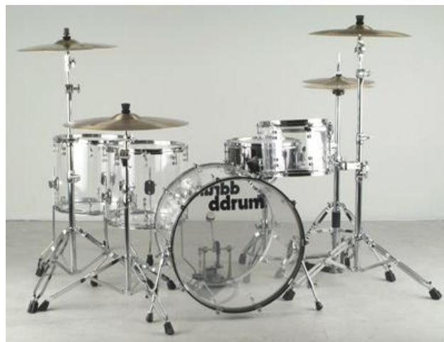
ddrum Acrylic Drum set

Acrylic drums are very noticeable on stage, not just because of the looks but of the sound also, which is brighter, louder and has more of a metallic tone on the lines of a metal snare. Since acrylic is a non porous material, the sound waves produced on the inside when the drum is hit, bounce like crazy, there is no absorption into the acrylic, so you will be getting pure sound from it.