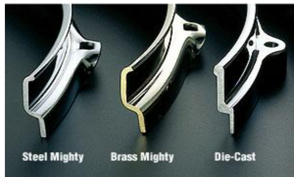
Tama Metal Hoops - The two on the left are triple flanged hoops